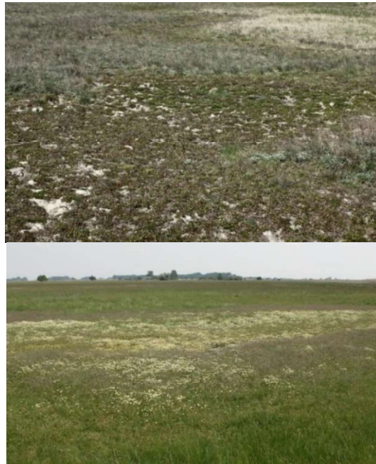
Figure 2. Alkali grasslands in Hortobágy National Park, East-Hungary.

also had high seed density in the seed banks, but loess specialist species were sparse or totally absent (Figure 3).