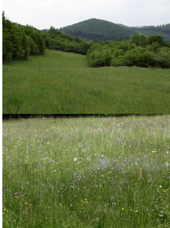
Figure 6. Mountain hay meadows in Zemplén Mountains, Northeast Hungary.