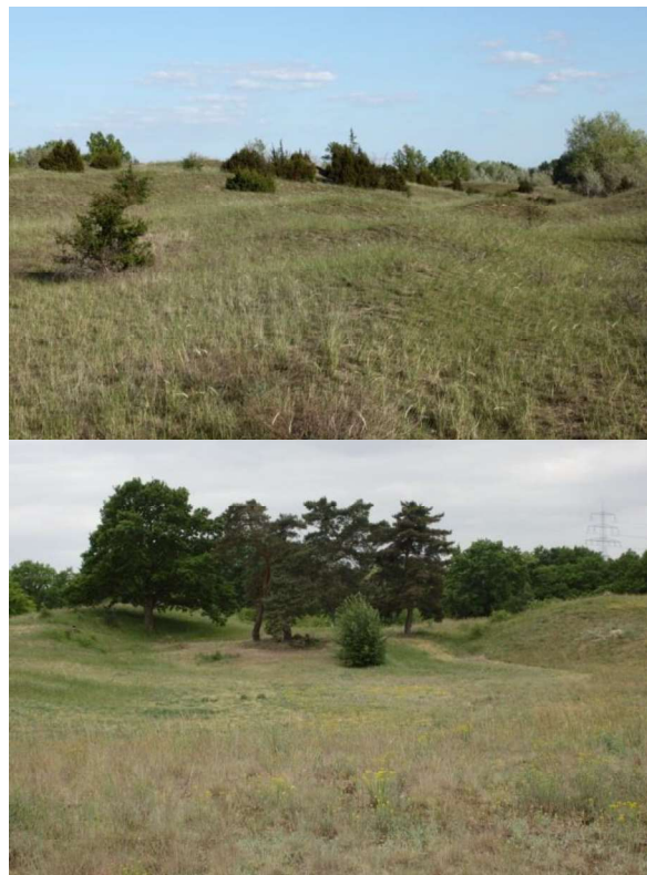
Figure 4. Sand grasslands in Kiskunság National Park, Central Hungary (left) and the Mainzer Sand, Southwest Germany (right).

maximum is in autumn samples. However, annuals had similar seed density scores in both periods while perennials were the ones who occurred mainly in autumn samples. Accordingly, the similarity of species composition was higher between the aboveground vegetation and autumn seed bank compared to spring seed bank. They also detected a higher seed density of annuals than that of perennials in closed patches where dominant grasses preferred vegetative spreading and were missing from the seed bank.