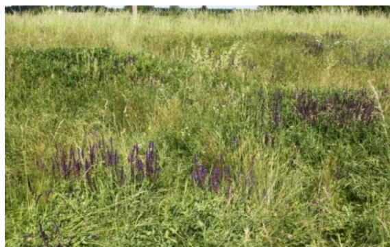
Figure 3. Loess grassland in Hortobágy National Park, East-Hungary. Photo of Tamás Miglécz.