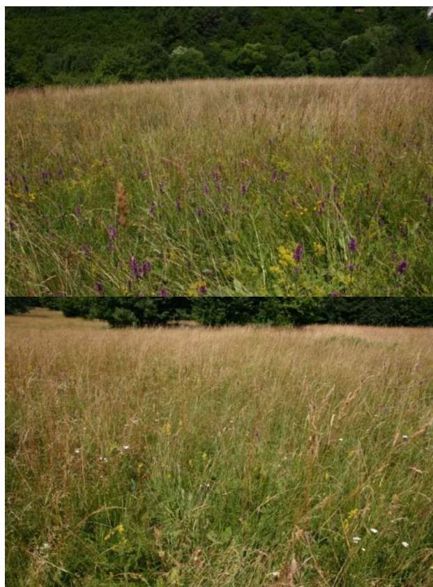
Figure 5. Mesic grasslands in Mátra, Northeast Hungary.

Seed banks of mesic grasslands in Germany were studied by Wellstein et al. (2007). They found the dominance of a few species ( Trifolium repens , Agrostis capillaris , Plantago lanceolata , Juncus bufonius , Leontodon autumnalis , Poa trivialis and Cerastium holosteoides ) in the seed bank. Species with high seed accumulation capacity and mostly persistent seeds were rare or absent from vegetation.